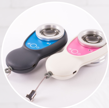
two color options available