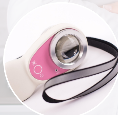
safety wrist strap - standard accessory