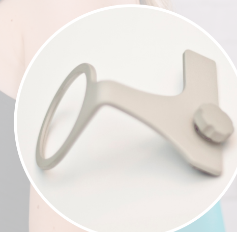
adapter for digital camera