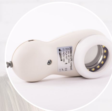
16 white LEDs for best visibility

phone/fax: +381 18 4291290, +381 18 4267469 Moravska 7, Cokot 18250 Novo Selo, Nis, Serbia