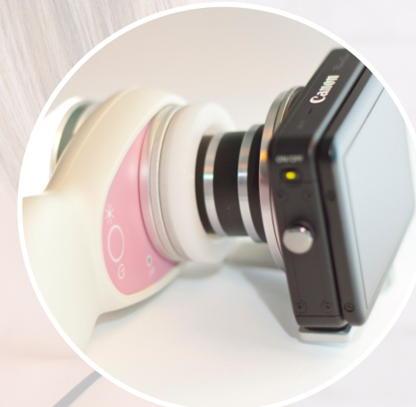
digital dermoscopy system