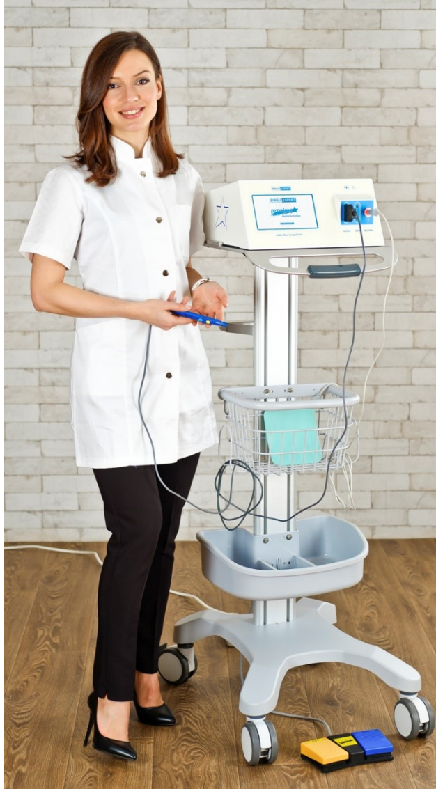
Device used – RWSU Expert