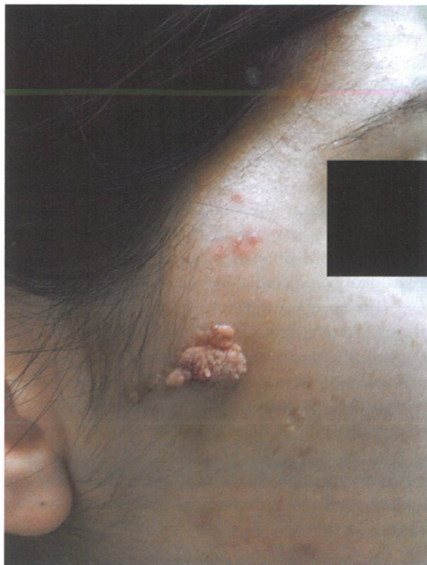
Figure 1. Facial lesion before treatment