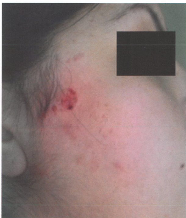
Figure 2. Affected area immediately after the treatment

Further therapy included local use of antibiotic ointments and anti-scar gel (Figure 3). On 4 week follow-up, VEN was totally removed, with no scars, with only mild erythema on previously affected skin (Figure 4). Due to the fact that VEN can recur, partially or completely, the patient was advised to do regular follow-ups, as well as maximum sun protection during summer months.