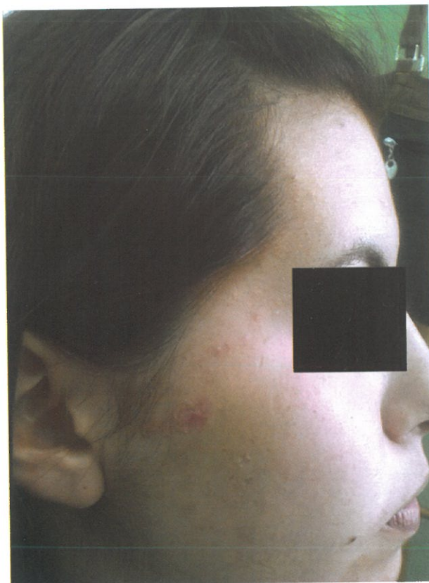
Figure 4 Treated area 4 weeks after the therapy

Therapeutic modalities are numerous and they are used depending on the localization and size of the lesion with different level of success (9). Topical or intralesional corticosteroids were used, as well as calcipotriol, 5-fluorouracil, podophyllin, retinoid, chemical peeling (33, 34), cryotherapy, dermabrasion, electrosurgery (1, 2), photodynamic therapy (11), different types of lasers, such as argon (35) ruby (36), erbium: yttrium aluminium garnet (Er : YAG) (37), carbon dioxide laser (2, 9, 10, 35, 38 - 40).